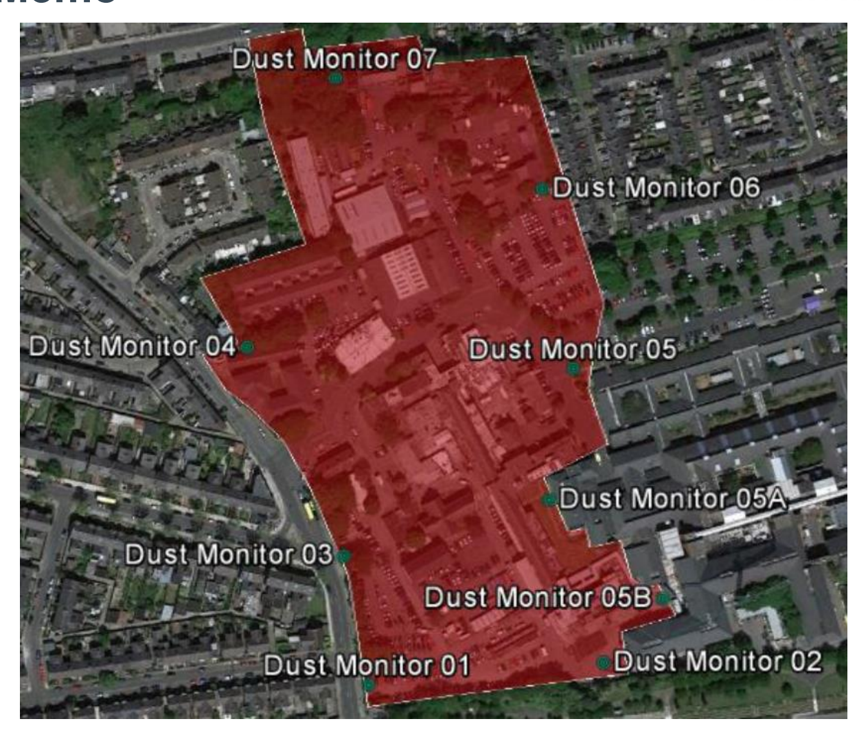
Figure 3. Previous location of Dust monitors on site (April 2017 to August 2017).